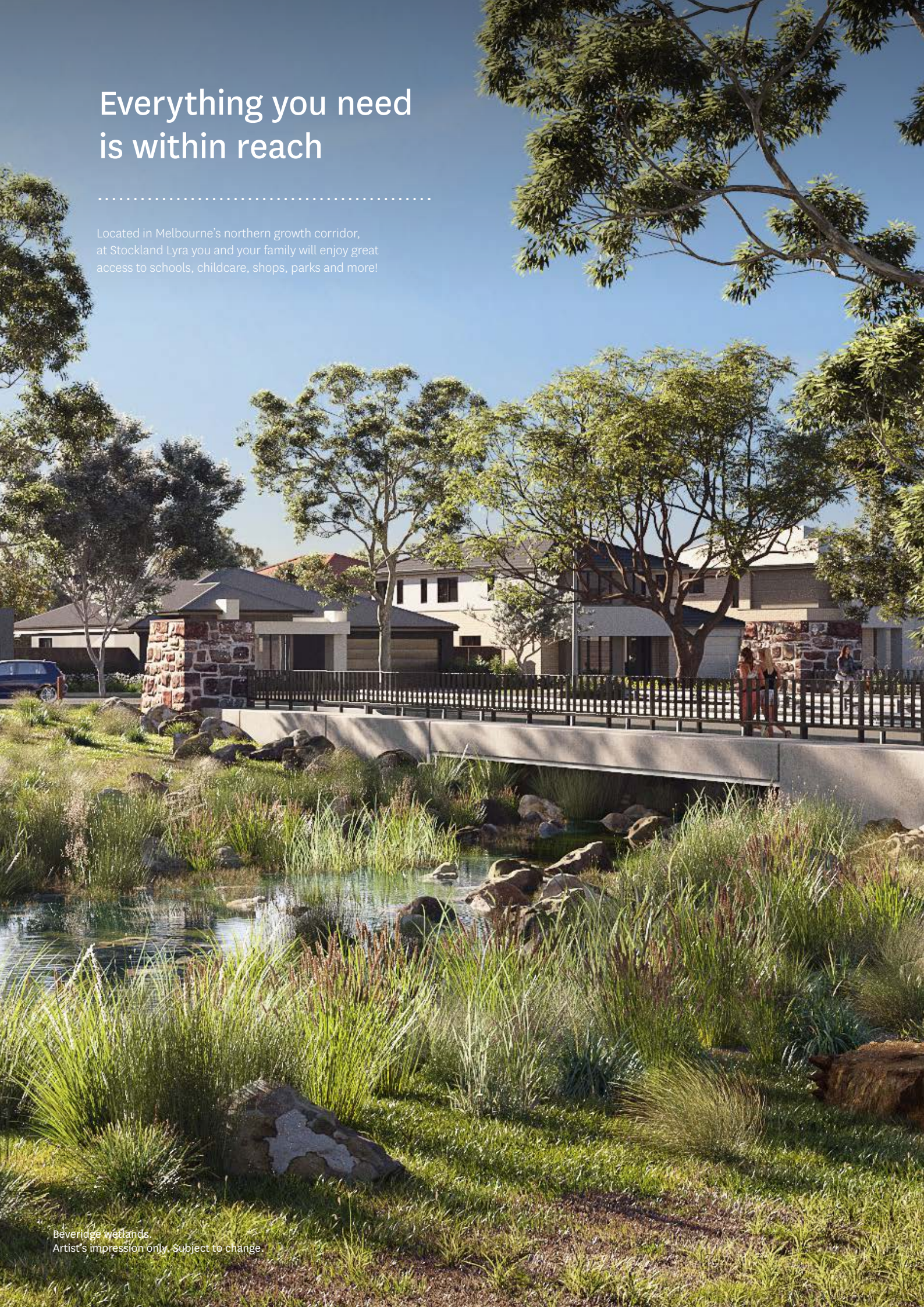
Beveridge wetlands. Artist's impression only. Subject to change.

Located in Melbourne's northern growth corridor, at Stockland Lyra you and your family will enjoy great access to schools, childcare, shops, parks and more!