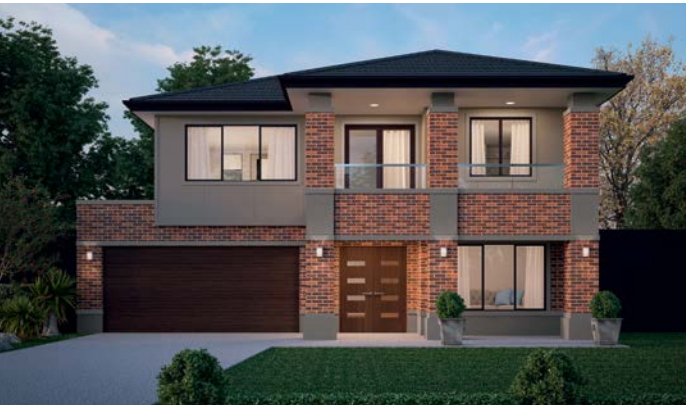
8. Orbit Homes Sorrento 415