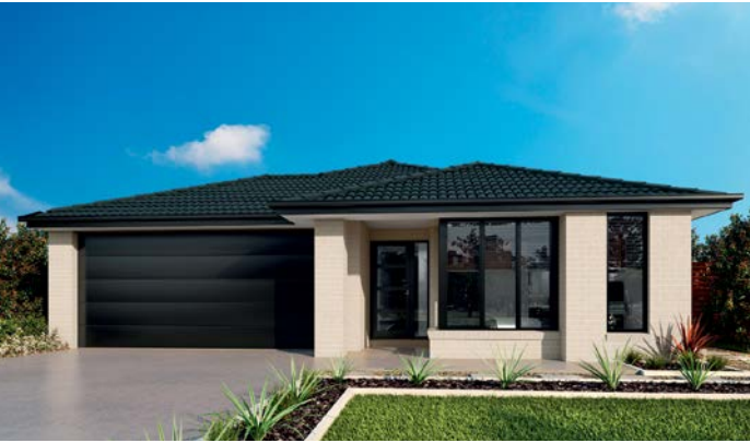
6. Simonds Homes Welford 25