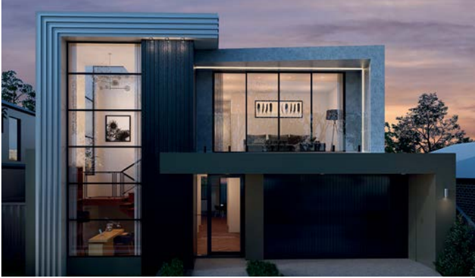
16. Windrock Blue Pearl 44