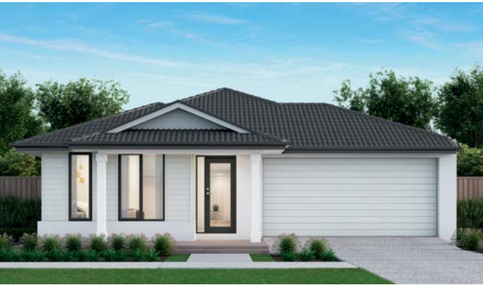
3. Homebuyers Centre Harvey 26