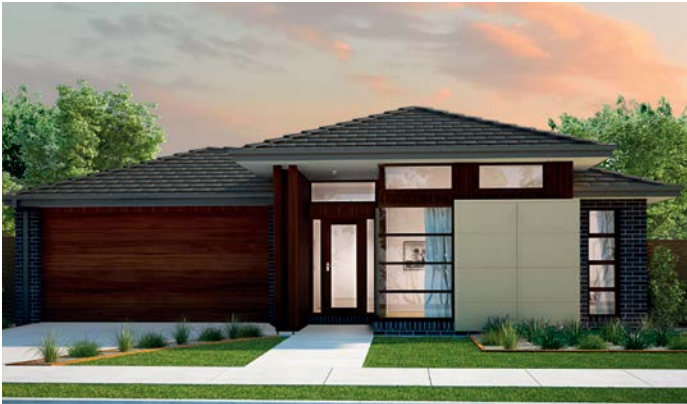
10. Burbank Hawkins 268