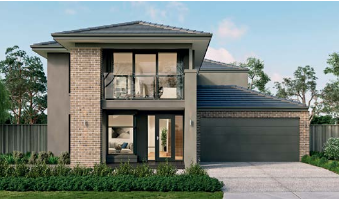
2. Metricon Savannah 41RF