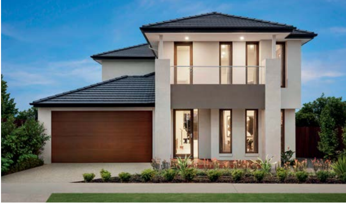
12. Eight Homes d FOUR