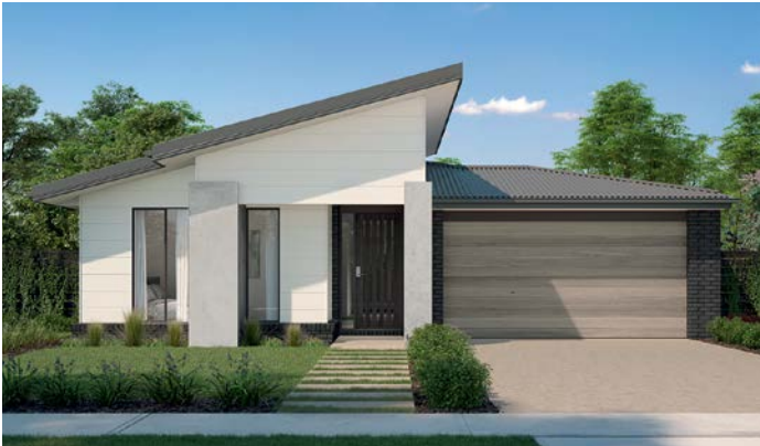
14. Henley Summit 28