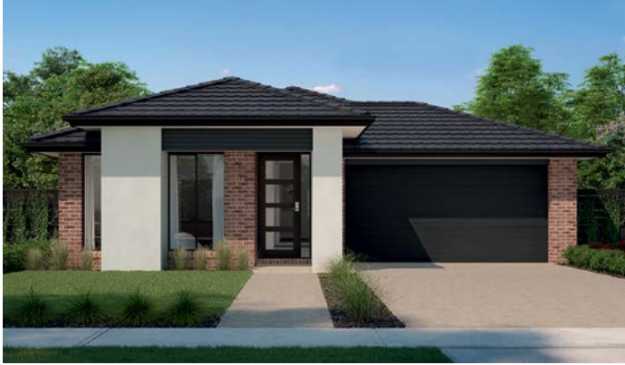
15. Henley Easton 22