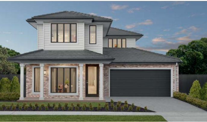
4. Boutique Homes Airlie 38