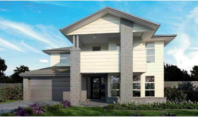
5. Simonds Homes Napier 53