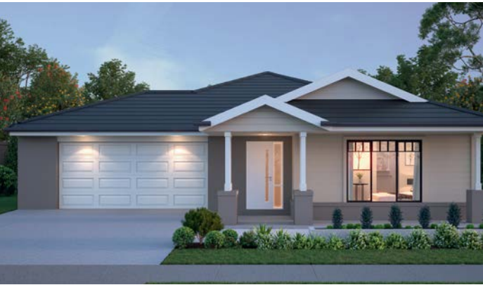
7. Orbit Homes Chevron 302