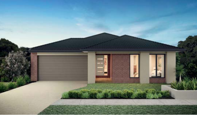
11. Eight Homes s FIVE