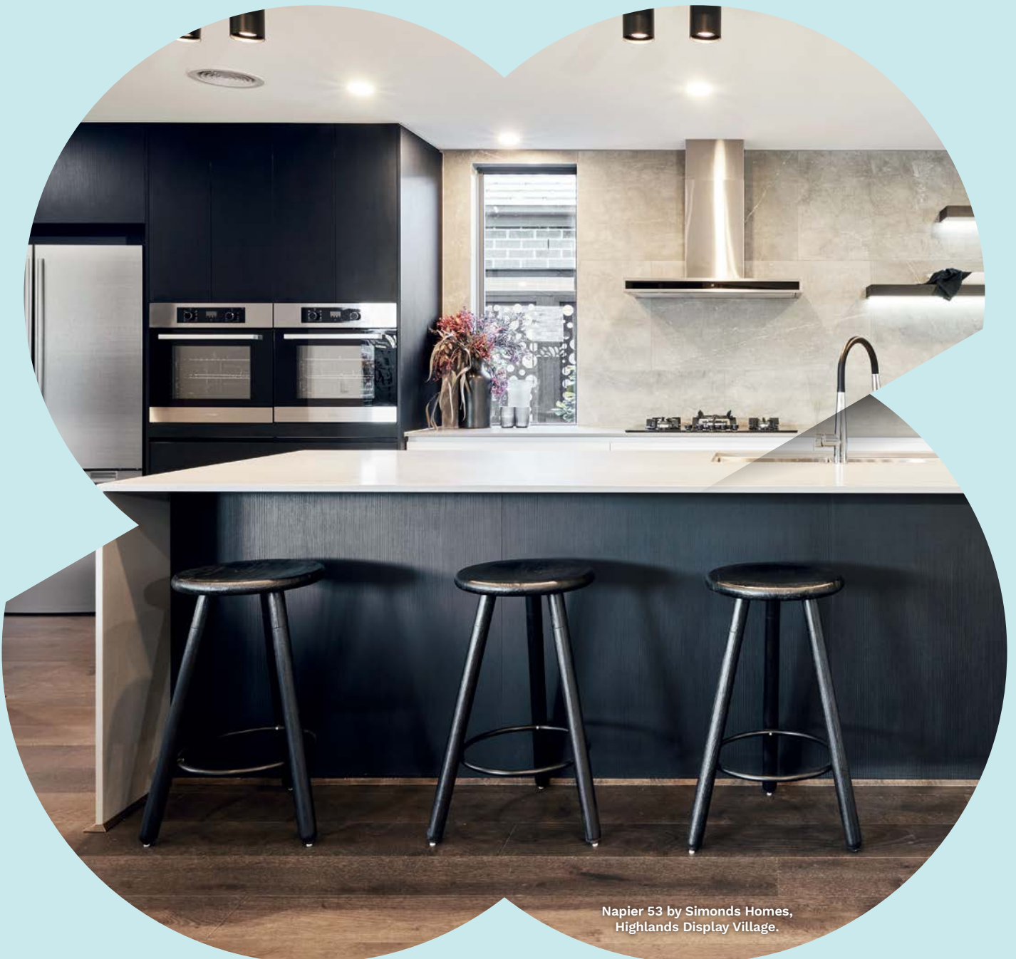
Napier 53 by Simonds Homes, Highlands Display Village.