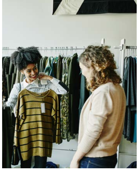
Indulge in some retail therapy Whether it's clothes, homewares or food,

Whether it's clothes, homewares or food, Craigieburn Central's extensive range of shops has it all and more.