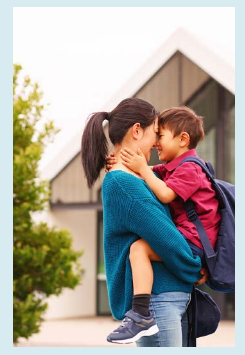
Walk your kids to school With 3 childcare centres, plus 5 primary schools and 1 secondary school, learning comes first at Highlands.