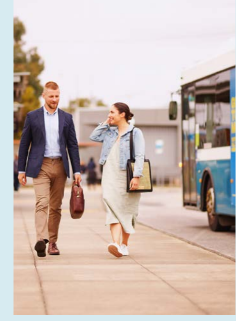
Commute with convenience Stay connected to Melbourne, with several PTV bus routes operating through Highlands and Craigieburn train station just 4km away.