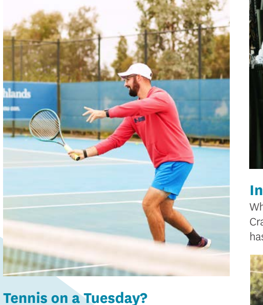
Tennis on a Tuesday? Meet friends at the local state-of-the art Hume Tennis Centre for a hit after work.