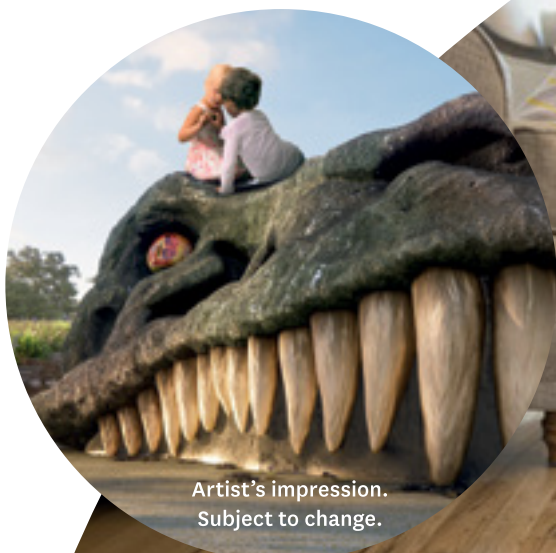
Artist's impression. Subject to change.