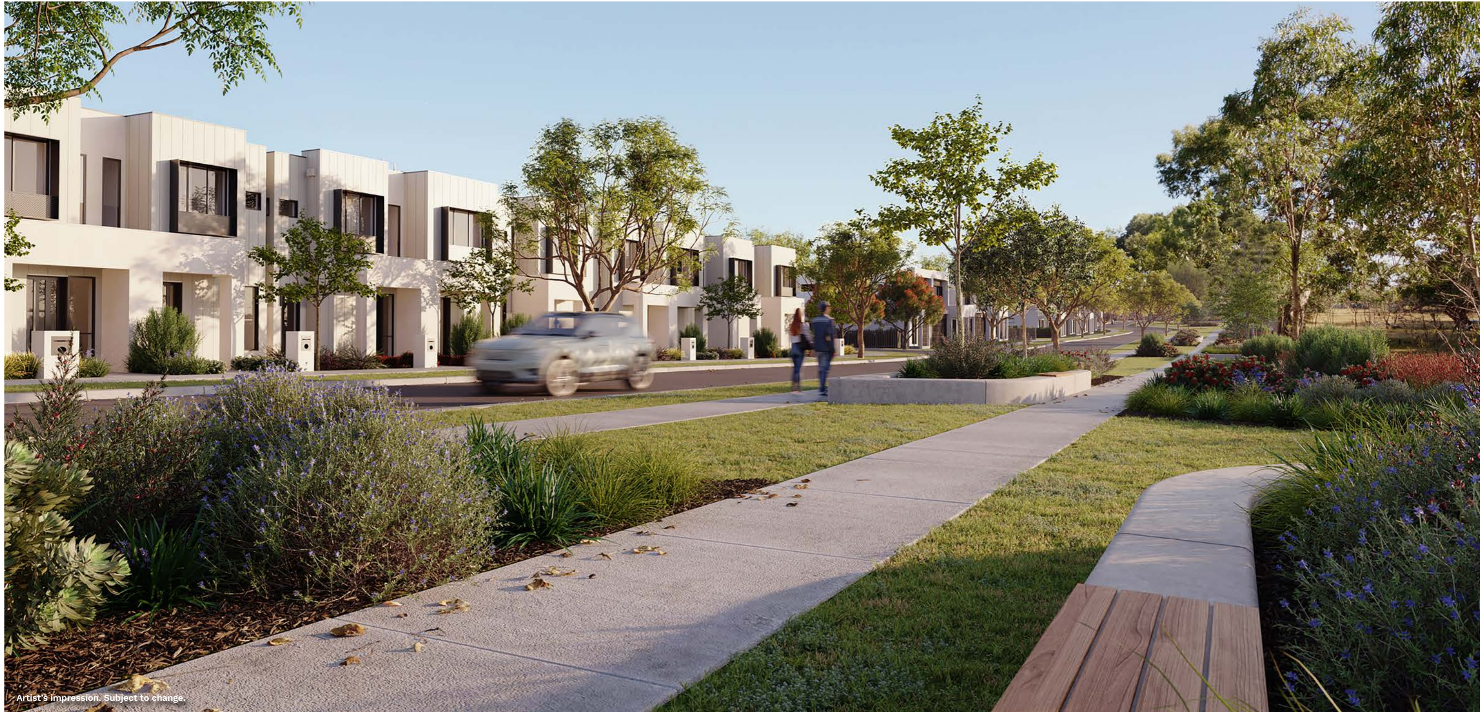
Artist's impression. Subject to change.