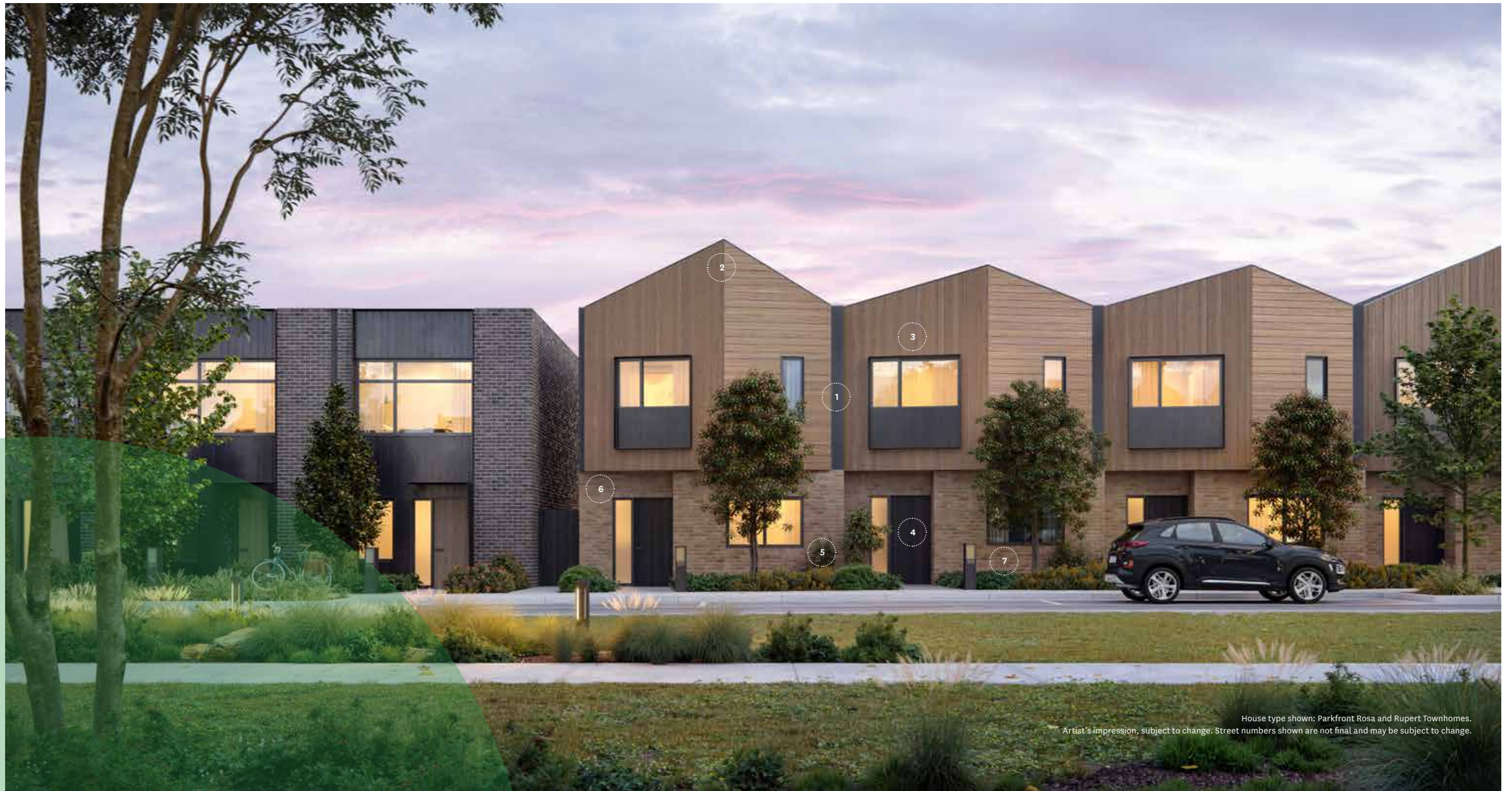
House type shown: Parkfront Rosa and Rupert Townhomes. Artist's impression, subject to change. Street numbers shown are not final and may be subject to change.