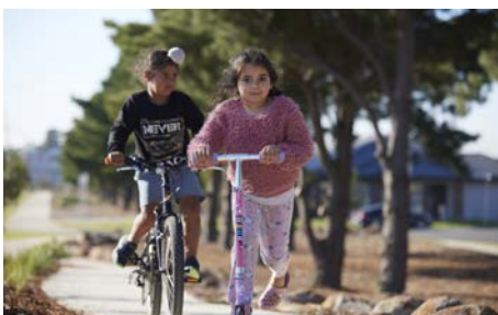
Walking and cycling paths