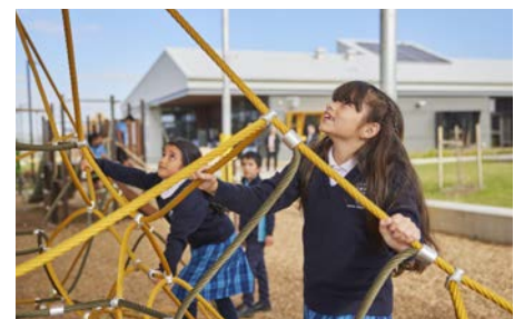
Gilgai Plains Primary School and Hume Anglican Grammar