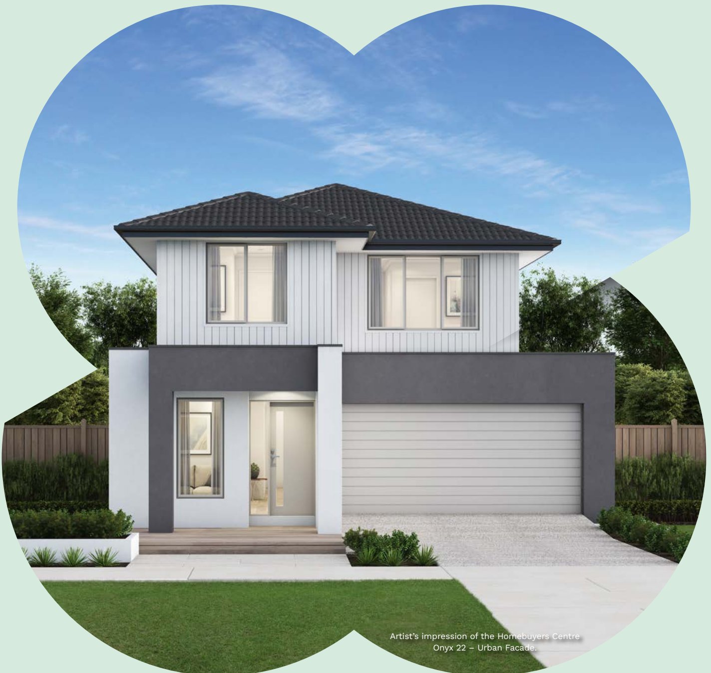
Artist's impression of the Homebuyers Centre Onyx 22 – Urban Facade.