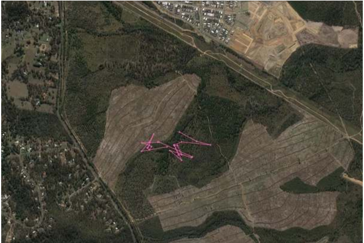
Figure 21. Plot of movements for Meghan.