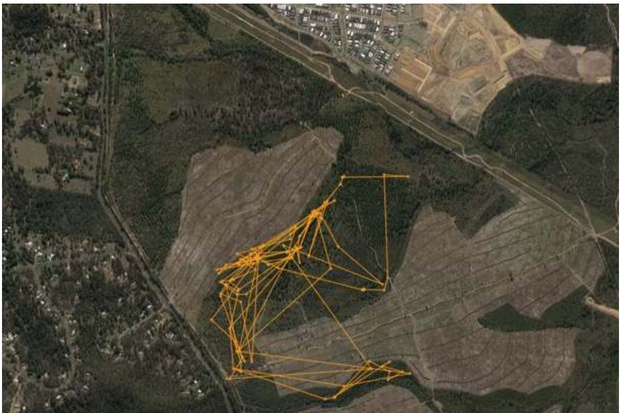
Figure 16. Plot of movements for Heath.