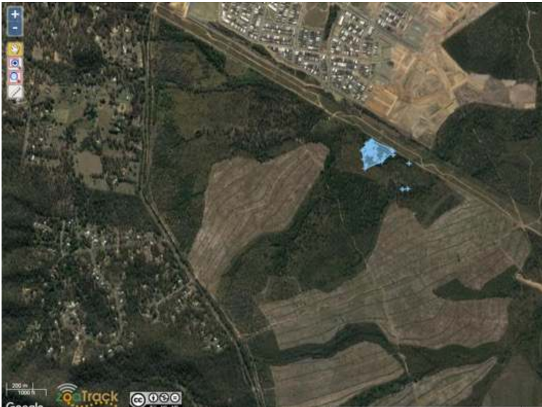
Figure 36. Plot of 95% MCP home range estimate for Nyunga.