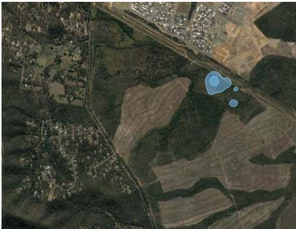
Figure 49. Plot of 50% and 95% KUD home range estimates for Nyunga. The 50% KUD is the smaller polygon within the largest 95% KUD polygon. The two small isolated polygons are part of the 95% KUD.