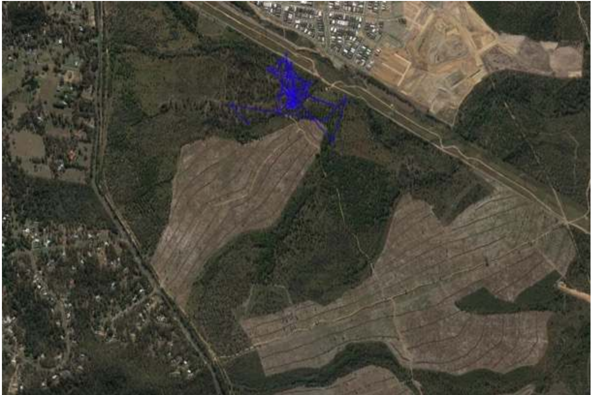
Figure 11. Plot of movements for Bomber.