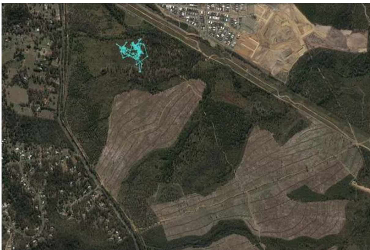
Figure 14. Plot of movements for Sue-Bob.