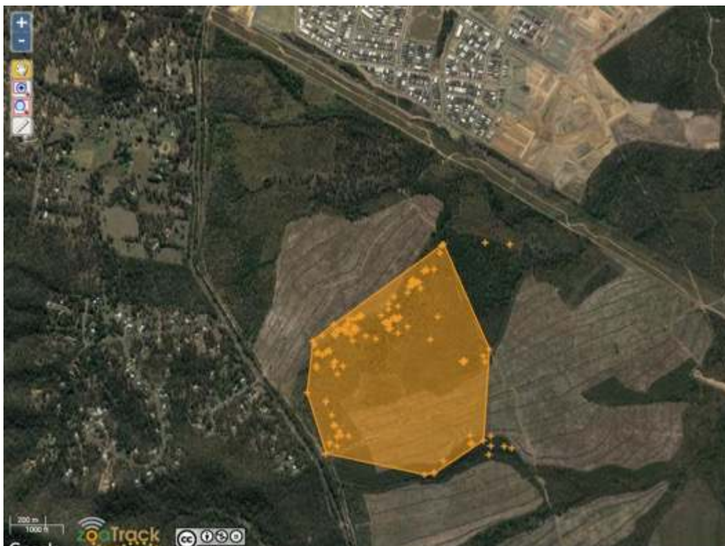
Figure 30. Plot of 95% MCP home range estimate for Heath.