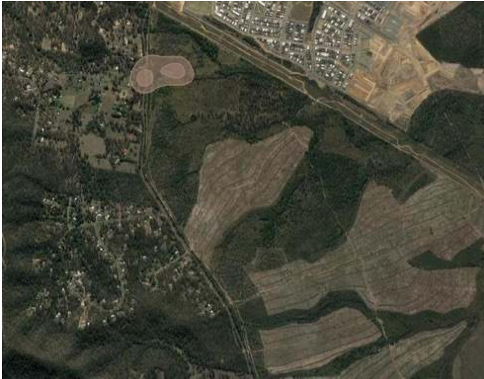
Figure 48. Plot of 50% and 95% KUD home range estimates for Millie Mae. The 50% KUD includes both the smaller polygons within the larger 95% KUD polygon.