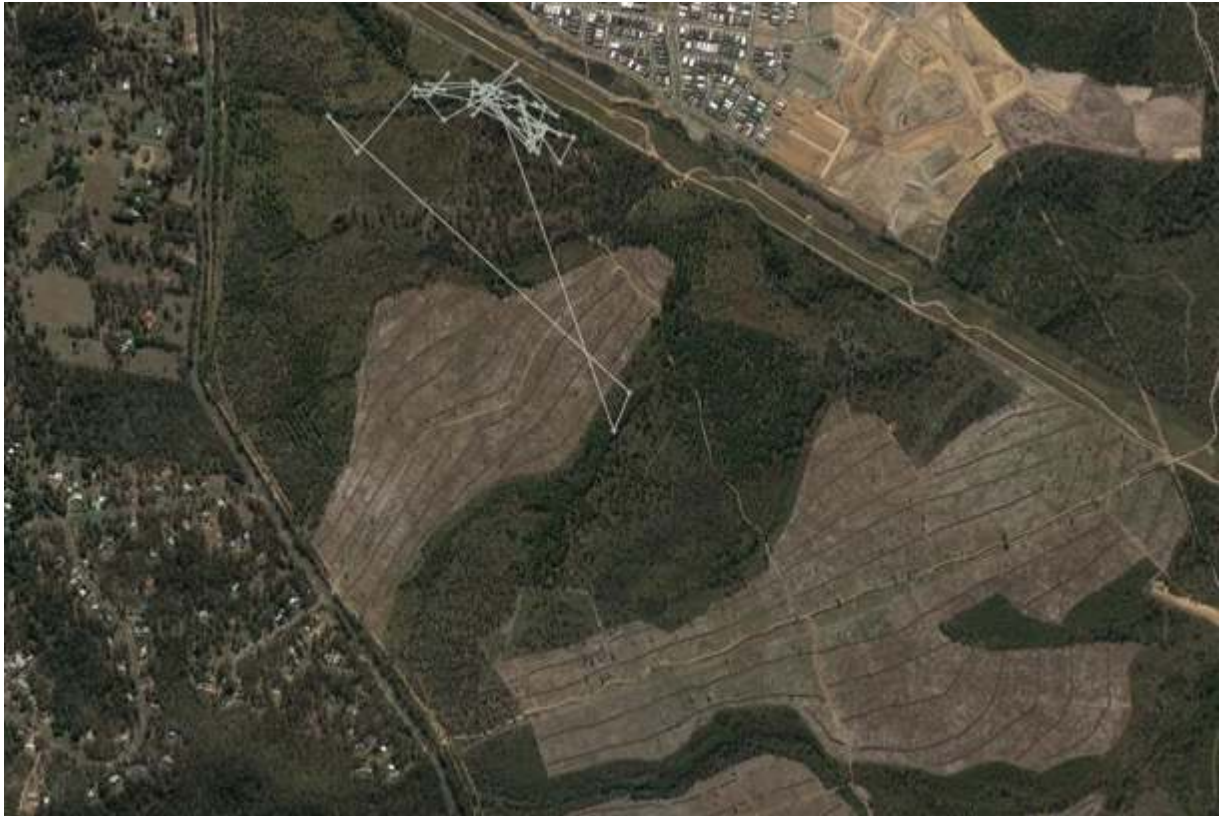
Figure 20. Plot of movements for Lucky.