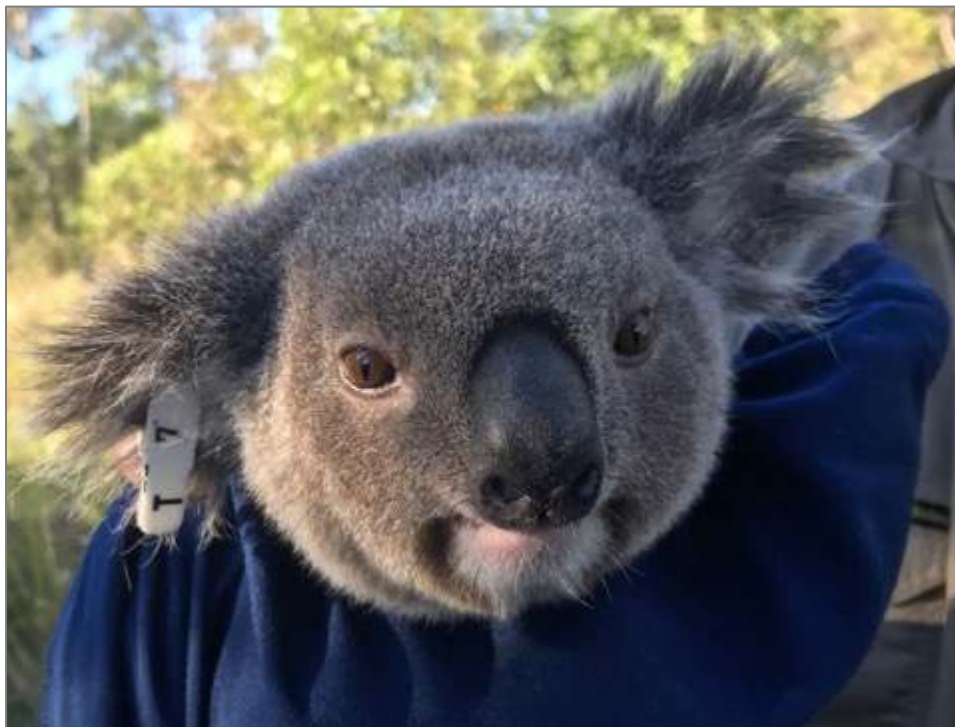
Figure 5. Image of Nyunga after fitting with white tag in the right ear; her eyes were clear.

The young female named Nyunga was first captured in May 2019 when she was 3.2kg and thought to be sexually immature (Figure 5). By the end of the year she had gained 1.2kg and was carrying her first pouch young, which is expected to be weaned in late 2020.