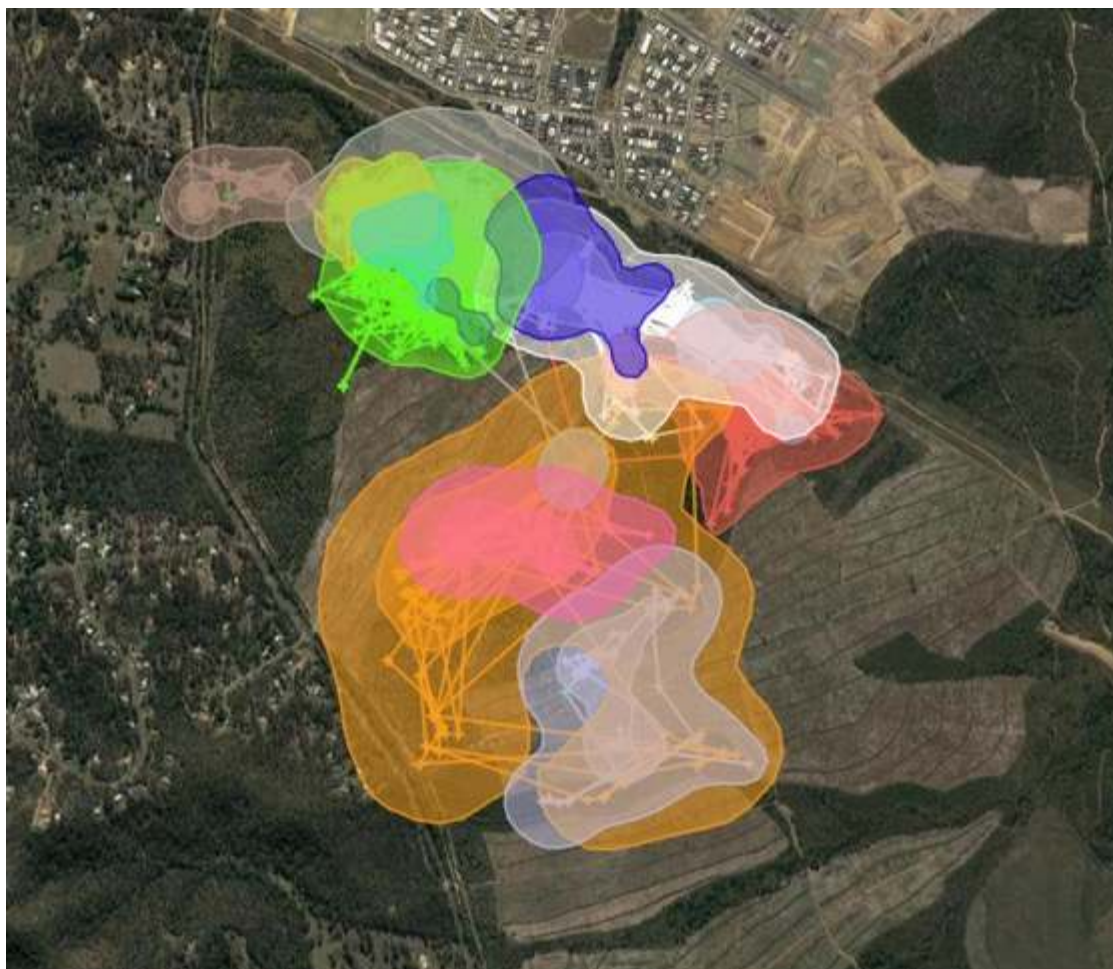
Figure 37. Plot of 50% & 95% KUD home range estimates for 12 koalas at the site in 2019.

Colour key: Bomber (dark blue), Cain (green), Jean (white), Sue-Bob (aqua), Zara (mustard), Heath (orange), Lilly (purple), Lindsay (red), Lucky (grey), Meghan (pink), Millie Mae (brown), Nyunga (light blue).