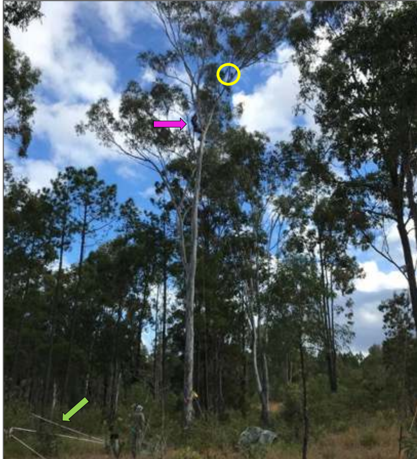
Figure 1. Image of the attempted capture of a koala (yellow circle) using the flagging method. The climber (pink arrow) used extendable poles (green arrow) to flag the koala down to a height that the ground team could take over and continue flagging it safely to the ground.