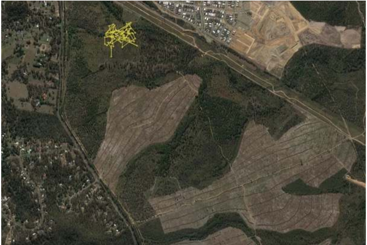
Figure 15. Plot of movements for Zara.