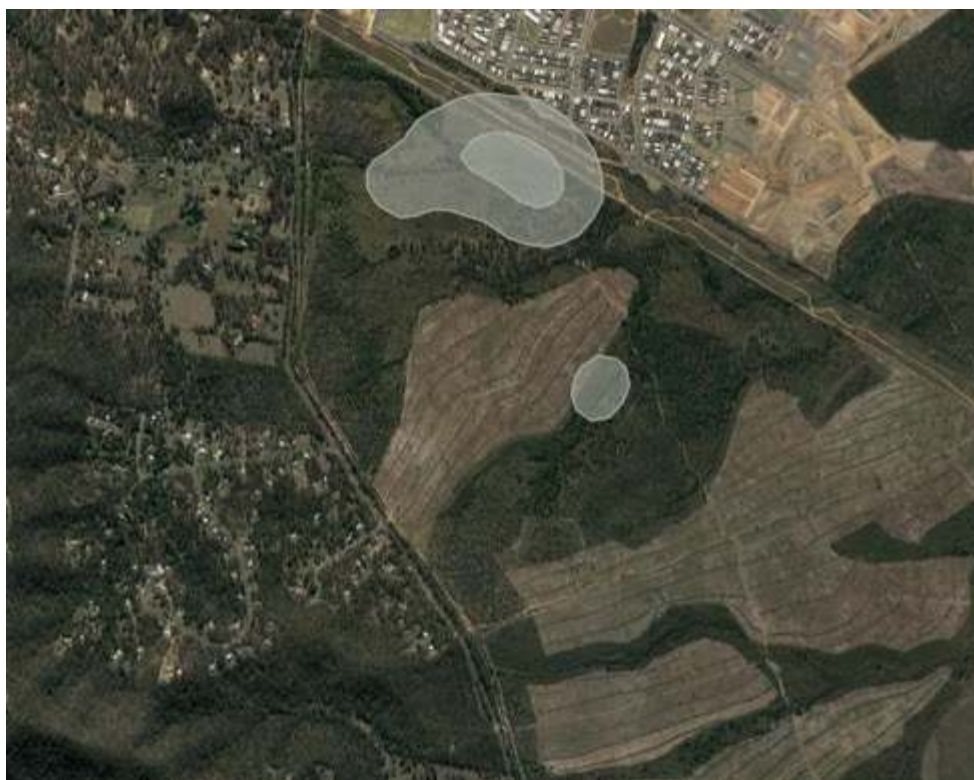
Figure 46. Plot of 50% and 95% KUD home range estimates for Lucky. The 50% KUD is the smaller polygon within the largest 95% KUD polygon. The small isolated polygon is part of the 95% KUD.