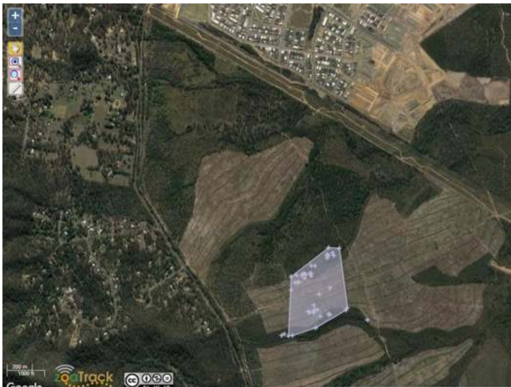
Figure 31. Plot of 95% MCP home range estimate for Lilly.