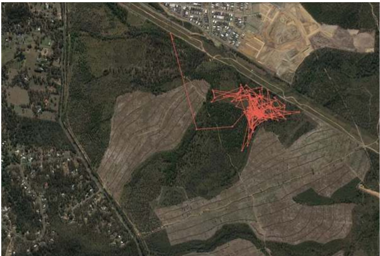
Figure 19. Plot of movements for Lindsay.