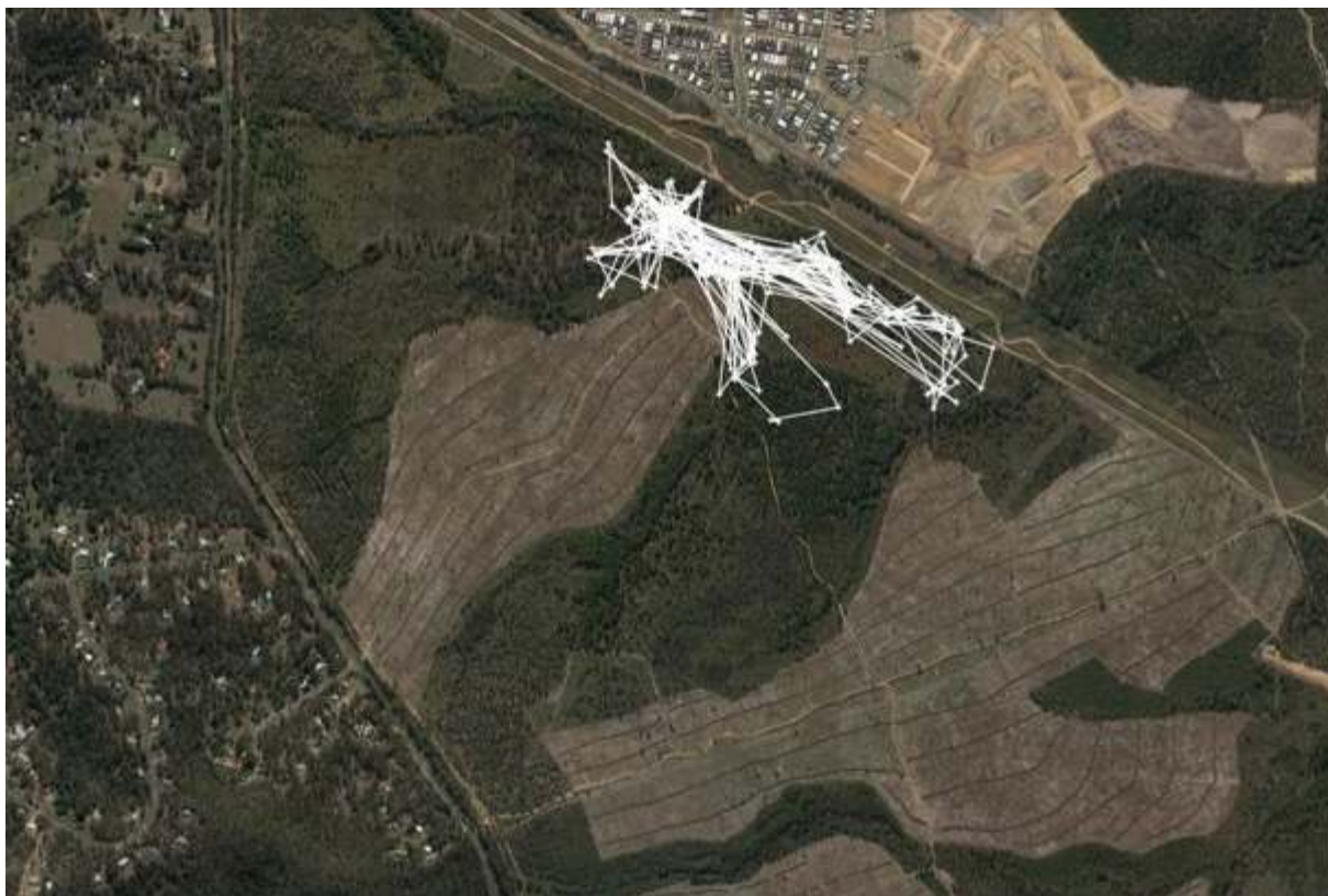
Figure 13. Plot of movements for Jean.