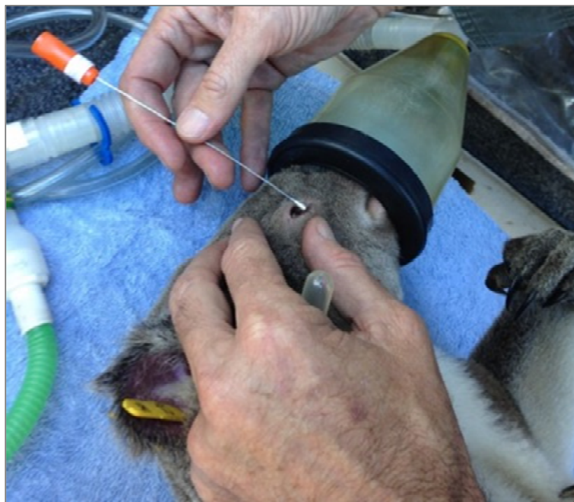
Figure 4. Image showing how a swab sample is taken from the eye of an anaesthetised koala.