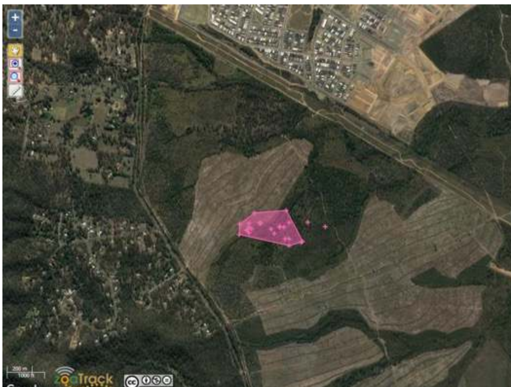
Figure 34. Plot of 95% MCP home range estimate for Meghan.