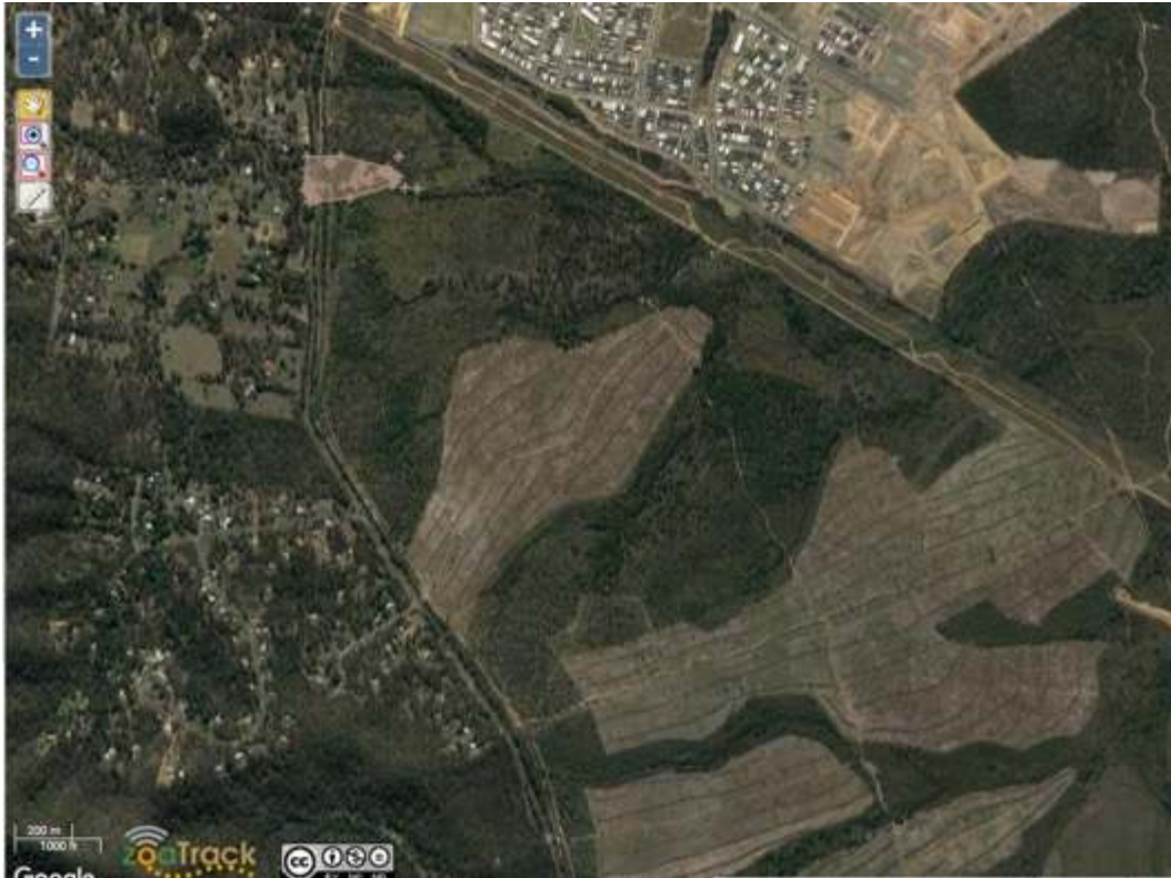
Figure 35. Plot of 95% MCP home range estimate for Millie Mae.