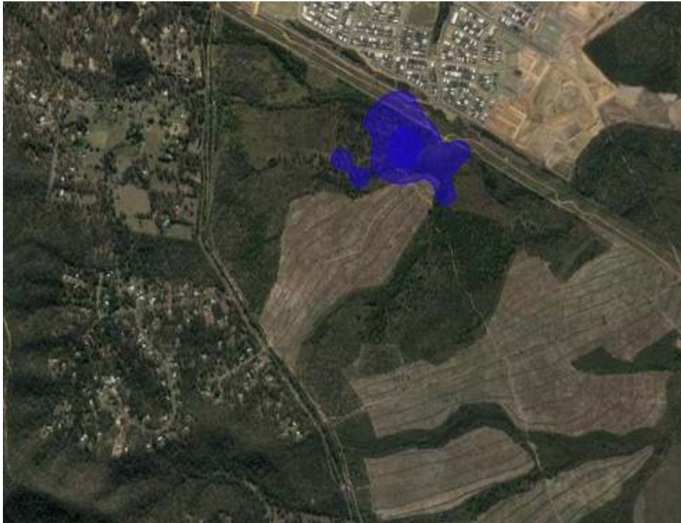
Figure 38. Plot of 50% and 95% KUD home range estimates for Bomber. The 50% KUD is the smaller polygon within the larger 95% KUD polygon.