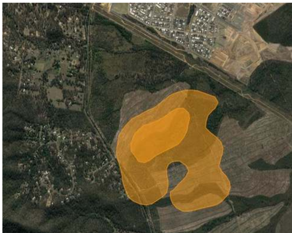
Figure 43. Plot of 50% and 95% KUD home range estimates for Heath. The 50% KUD is the smaller polygon within the larger 95% KUD polygon.