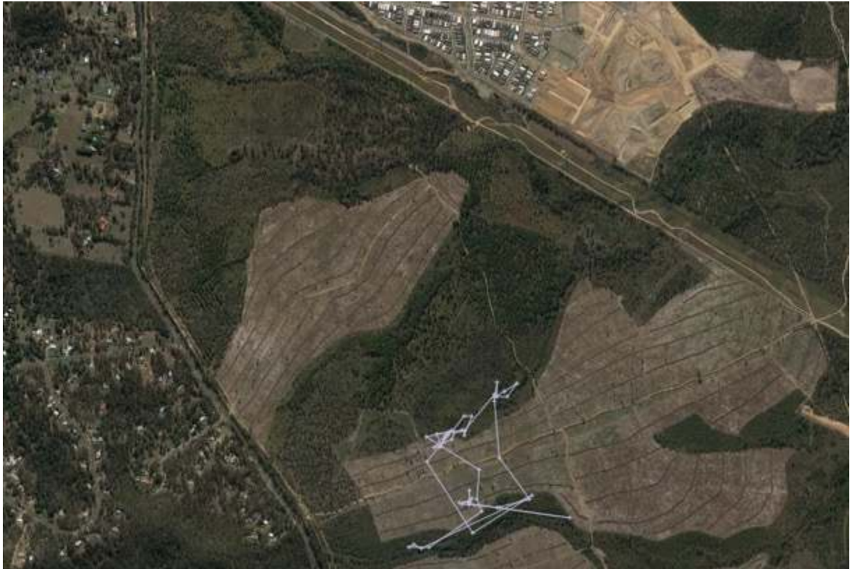
Figure 18. Plot of movements for Lilly.