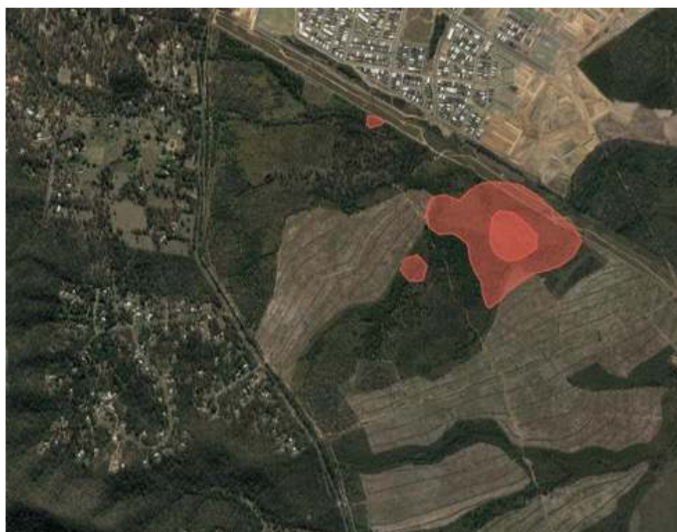
Figure 45. Plot of 50% and 95% KUD home range estimates for Lindsay. The 50% KUD is the smaller polygon within the largest 95% KUD polygon. The two small isolated polygons are part of the 95% KUD.