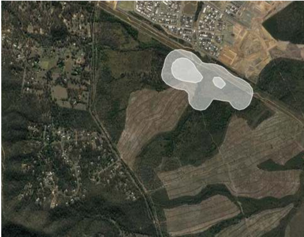
Figure 40. Plot of 50% and 95% KUD home range estimates for Jean. The 50% KUD are the smaller polygons within the larger 95% KUD polygon.