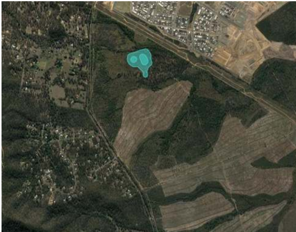
Figure 41. Plot of 50% and 95% KUD home range estimates for Sue-Bob. The 50% KUD are the smaller polygons within the larger 95% KUD polygon.