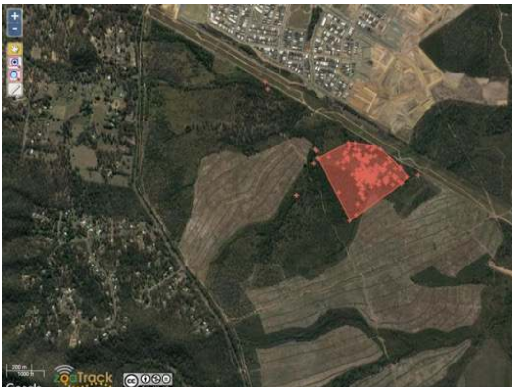
Figure 32. Plot of 95% MCP home range estimate for Lindsay.