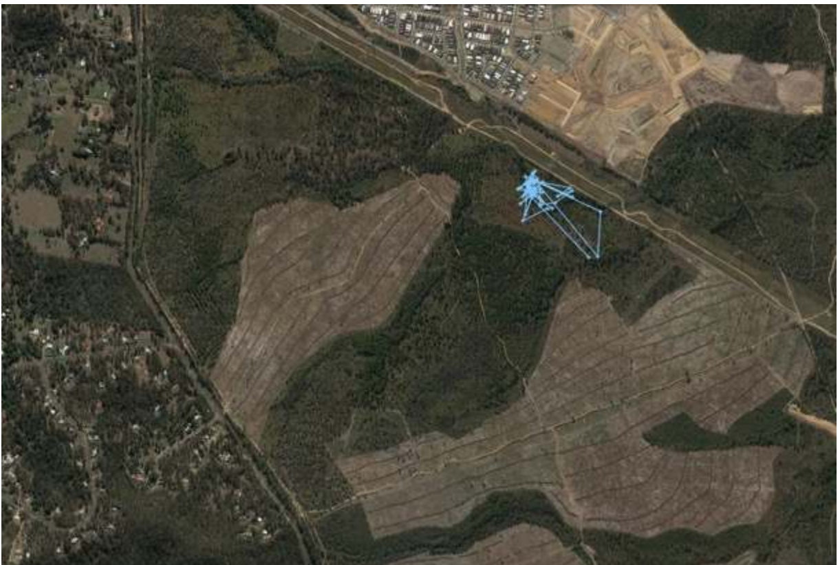
Figure 23. Plot of movements for Nyunga.