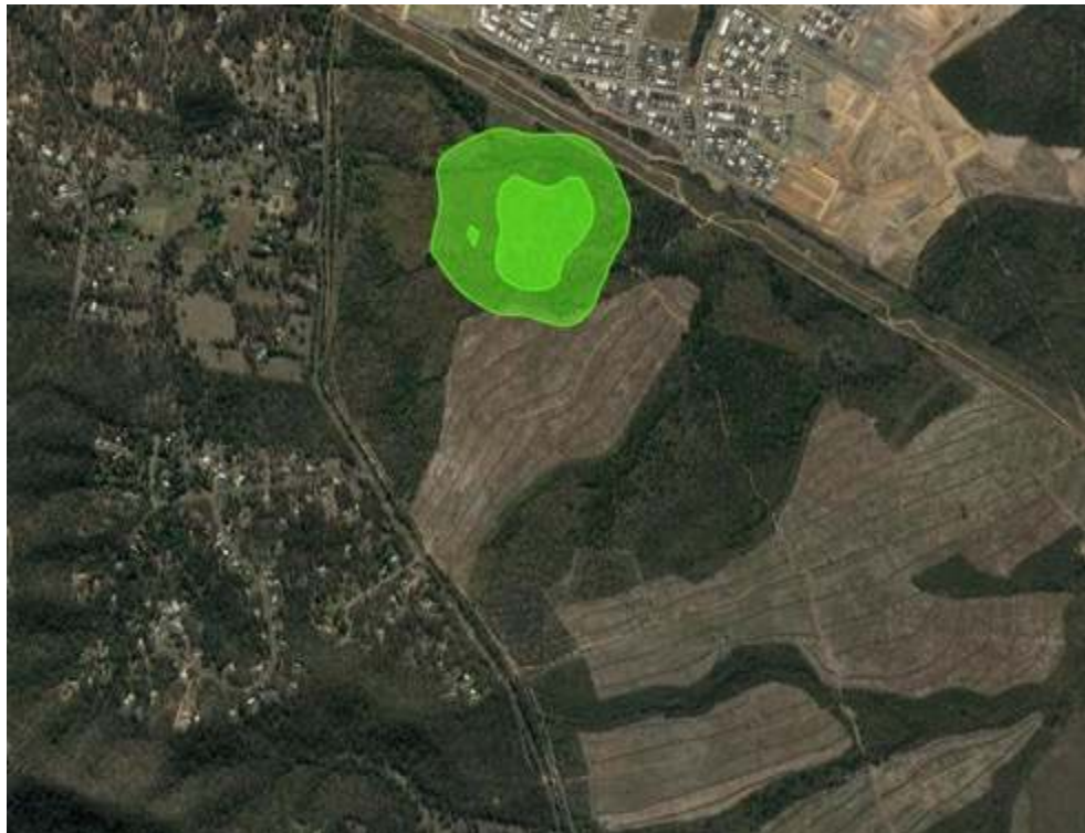
Figure 39. Plot of 50% and 95% KUD home range estimates for Cain. The 50% KUD are the two smaller polygons within the larger 95% KUD polygon.