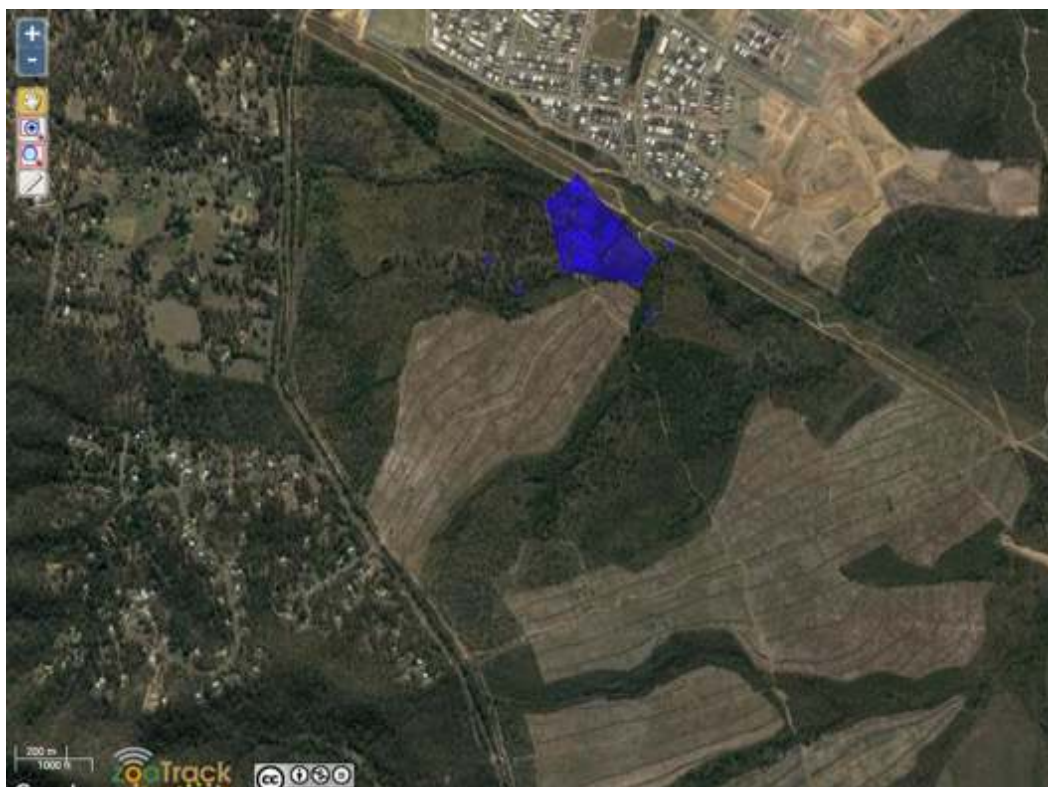
Figure 25. Plot of 95% MCP home range estimate for Bomber.