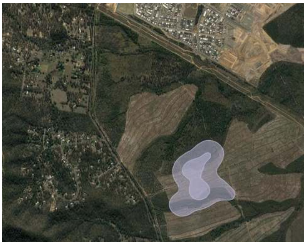
Figure 44. Plot of 50% and 95% KUD home range estimates for Lilly. The 50% KUD is the smaller polygon within the larger 95% KUD polygon.