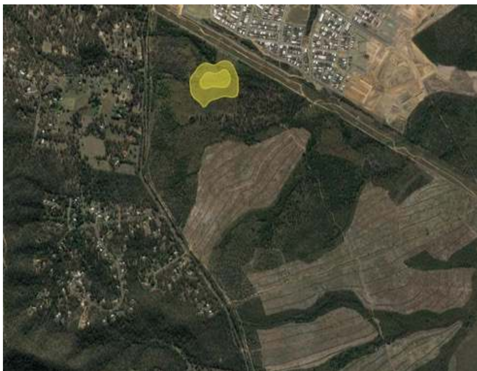
Figure 42. Plot of 50% and 95% KUD home range estimates for Zara. The 50% KUD is the smaller polygon within the larger 95% KUD polygon.