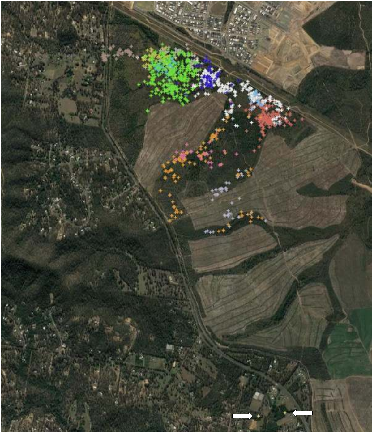
Figure 9. Plot of locations that were retained for data analyses, for the 13 koalas collared in 2019. Two locations were recorded for Kevin after he dispersed off site (white arrows).

Colour key: Bomber (dark blue), Cain (green), Jean (white), Sue-Bob (aqua), Zara (mustard), Heath (orange), Kevin (yellow), Lilly (purple), Lindsay (red), Lucky (grey), Meghan (pink), Millie Mae (brown), Nyunga (light blue).