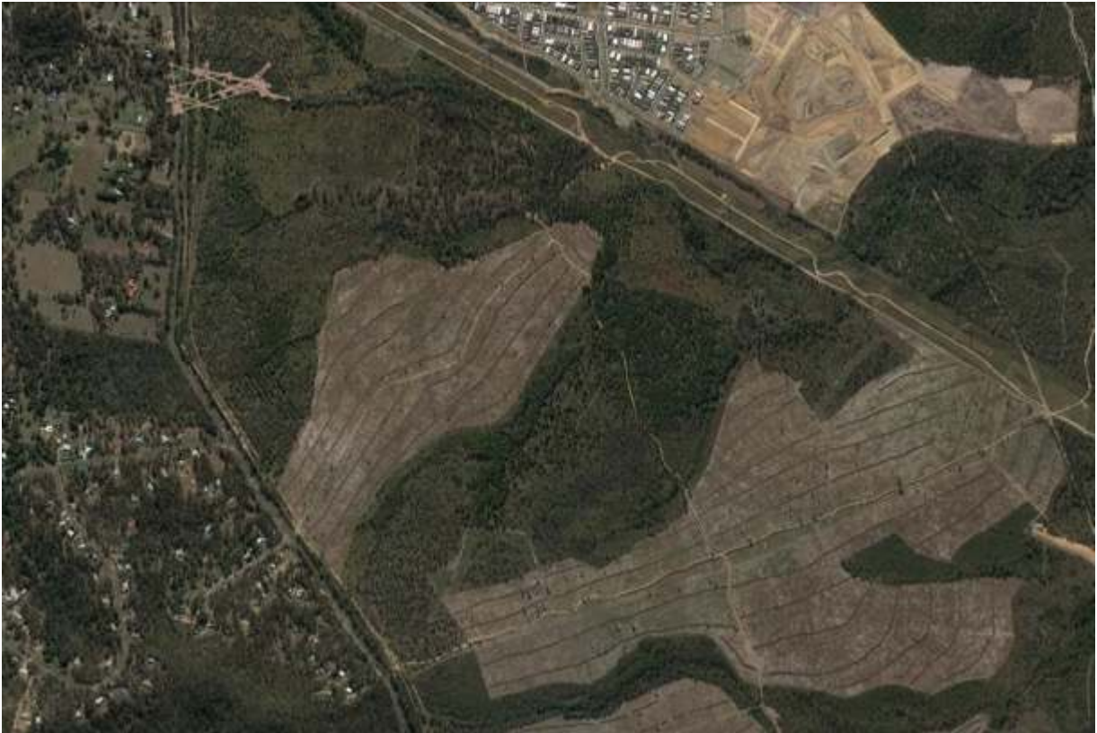
Figure 22. Plot of movements for Millie Mae.