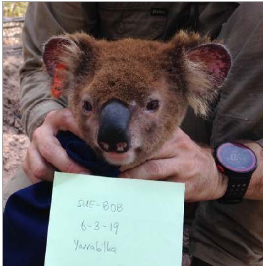
Figure 6. Image of Sue-Bob, showing the brown thinned fur on her face and ears.

The old female named Sue-Bob was first captured in October 2017. In 2018, she weaned a young male (Kevin) despite being in poor body condition throughout the lactation period. In 2019, it was possible that she was 10-12yrs old. Her collar was removed in March because she had lost body condition, had patches of thinned fur and was very skinny, suggesting she was nearing the end of life (Figure 6).