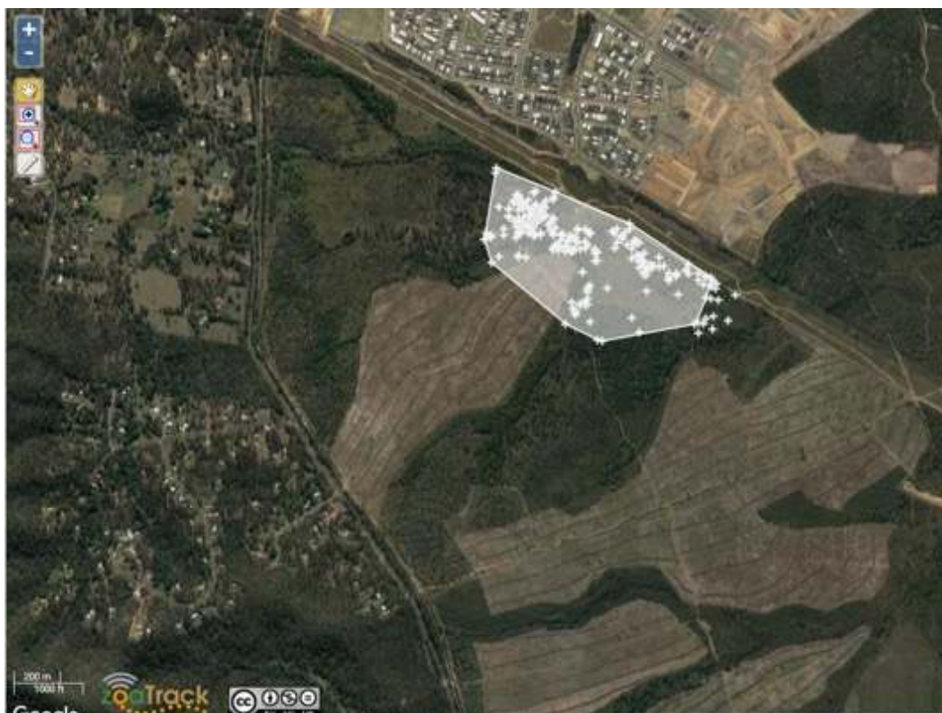
Figure 27. Plot of 95% MCP home range estimate for Jean.