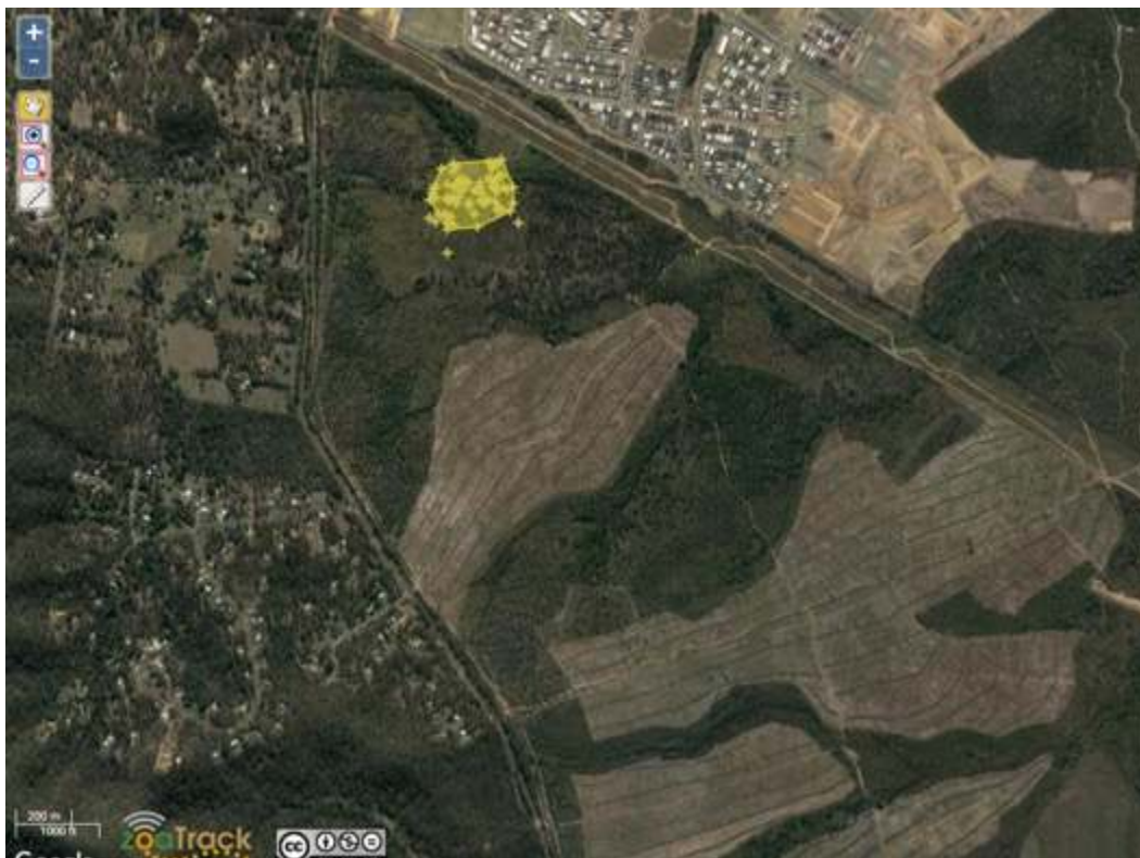
Figure 29. Plot of 95% MCP home range estimate for Zara.