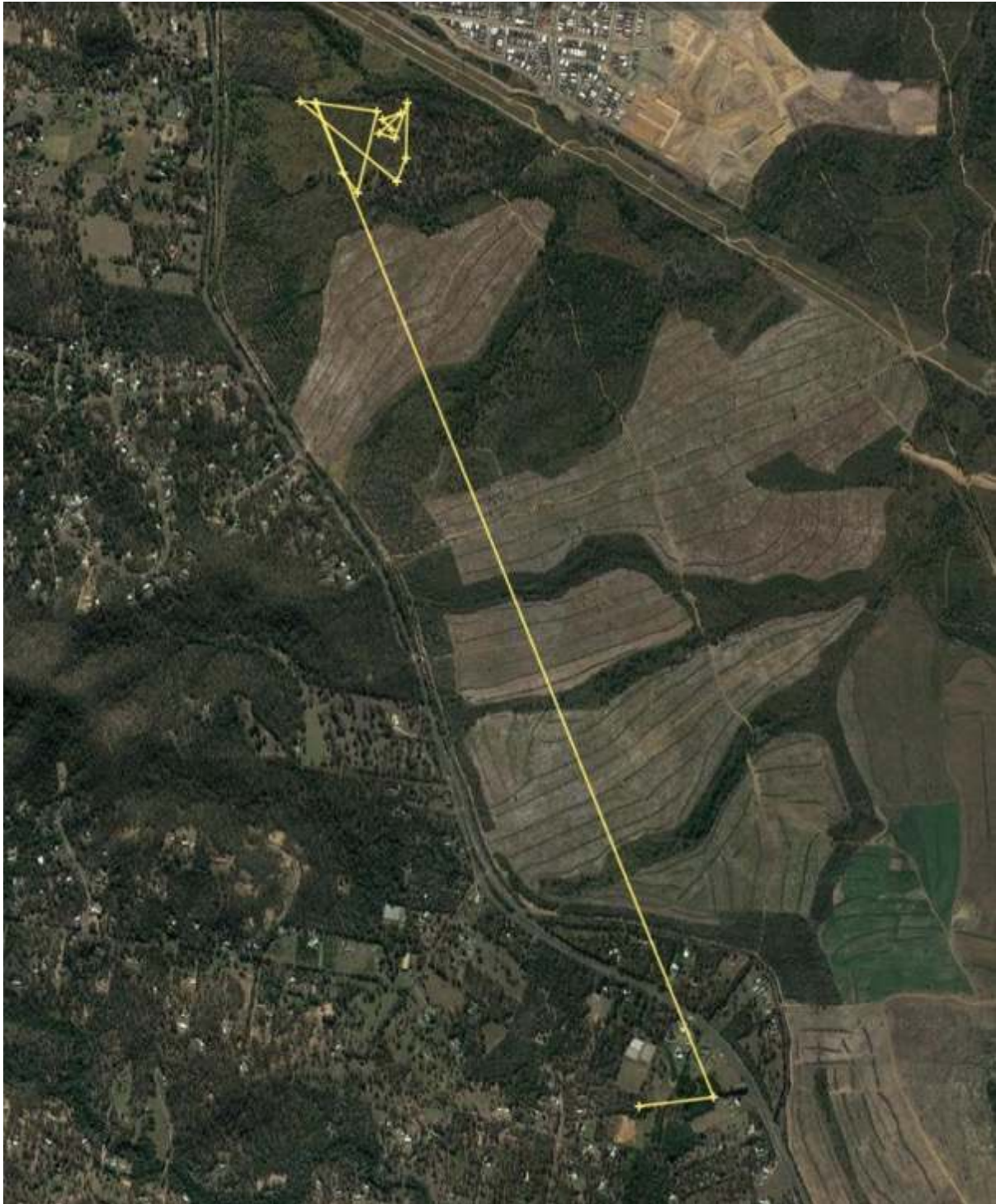
Figure 17. Plot of movements for Kevin.