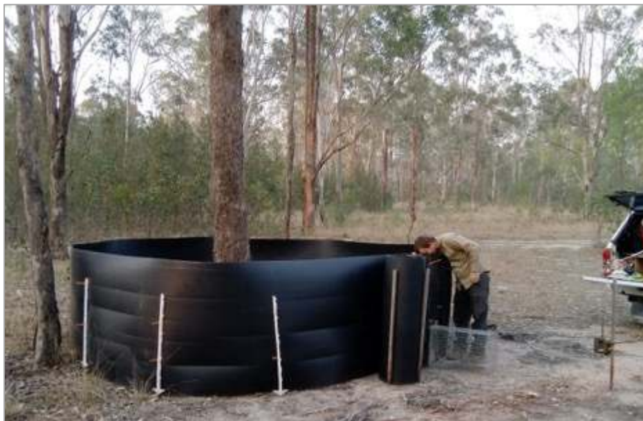
Figure 2. Image of a fence trap set up around an isolated tree to try and catch a koala; an SMS motion-sensor camera (bottom right) was used to send an immediate alert if the koala entered the trap.