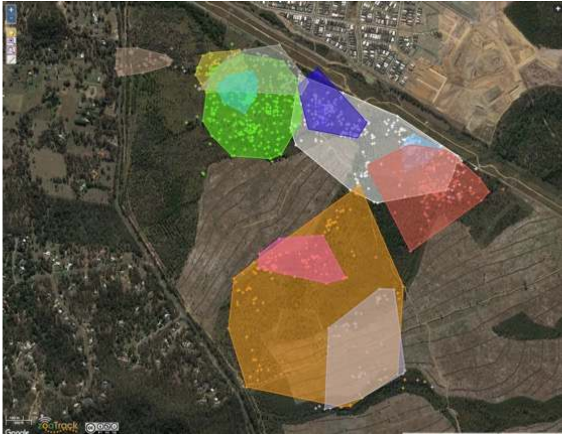
Figure 24. Plot of 95% MCP home range estimates for 12 koalas at the site in 2019.

Colour key: Bomber (dark blue), Cain (green), Jean (white), Sue-Bob (aqua), Zara (mustard), Heath (orange), Lilly (purple), Lindsay (red), Lucky (grey), Meghan (pink), Millie Mae (brown), Nyunga (light blue).