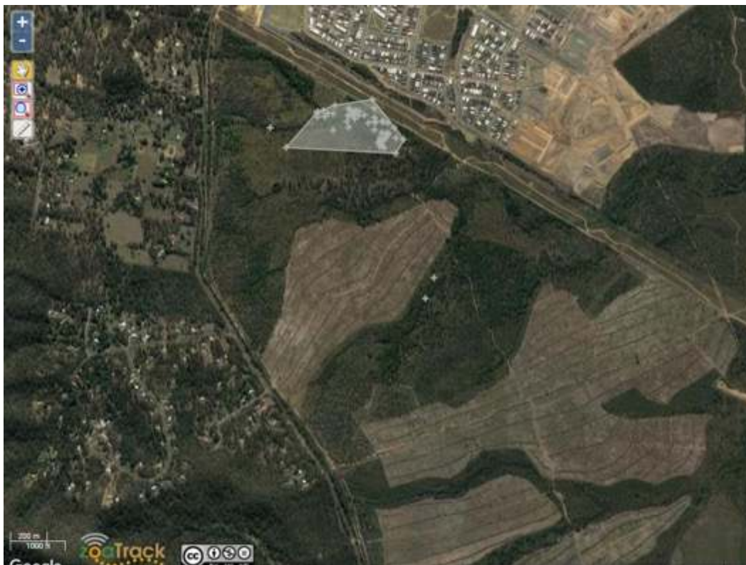
Figure 33. Plot of 95% MCP home range estimate for Lucky.