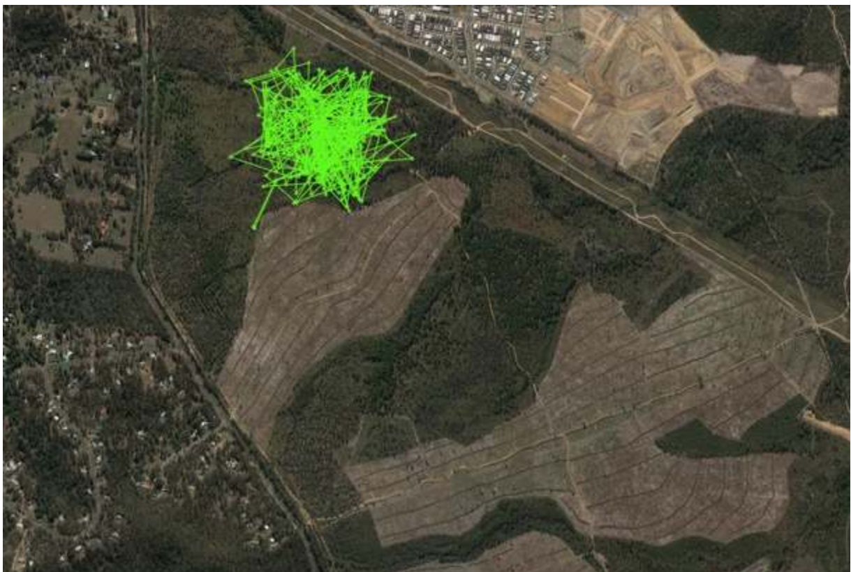
Figure 12. Plot of movements for Cain.