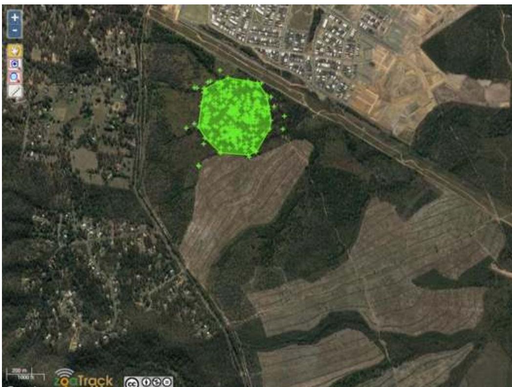
Figure 26. Plot of 95% MCP home range estimate for Cain.