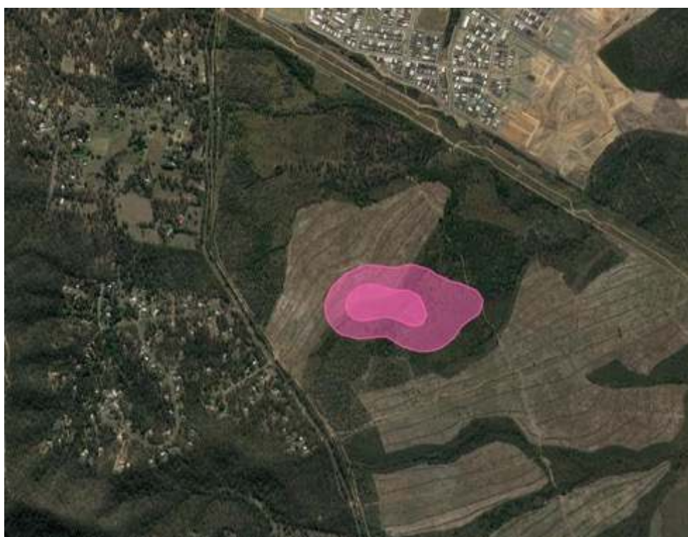
Figure 47. Plot of 50% and 95% KUD home range estimates for Meghan. The 50% KUD is the smaller polygon within the larger 95% KUD polygon.