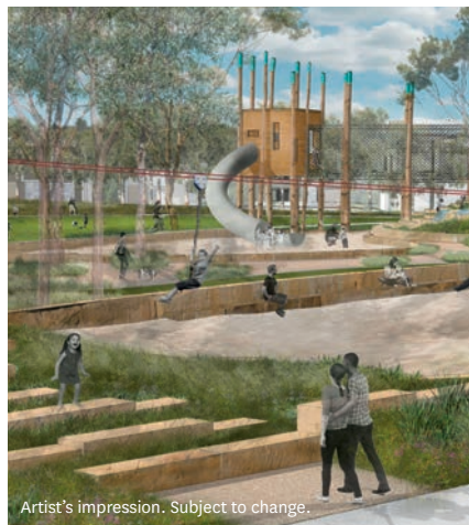
Artist's impression. Subject to change.