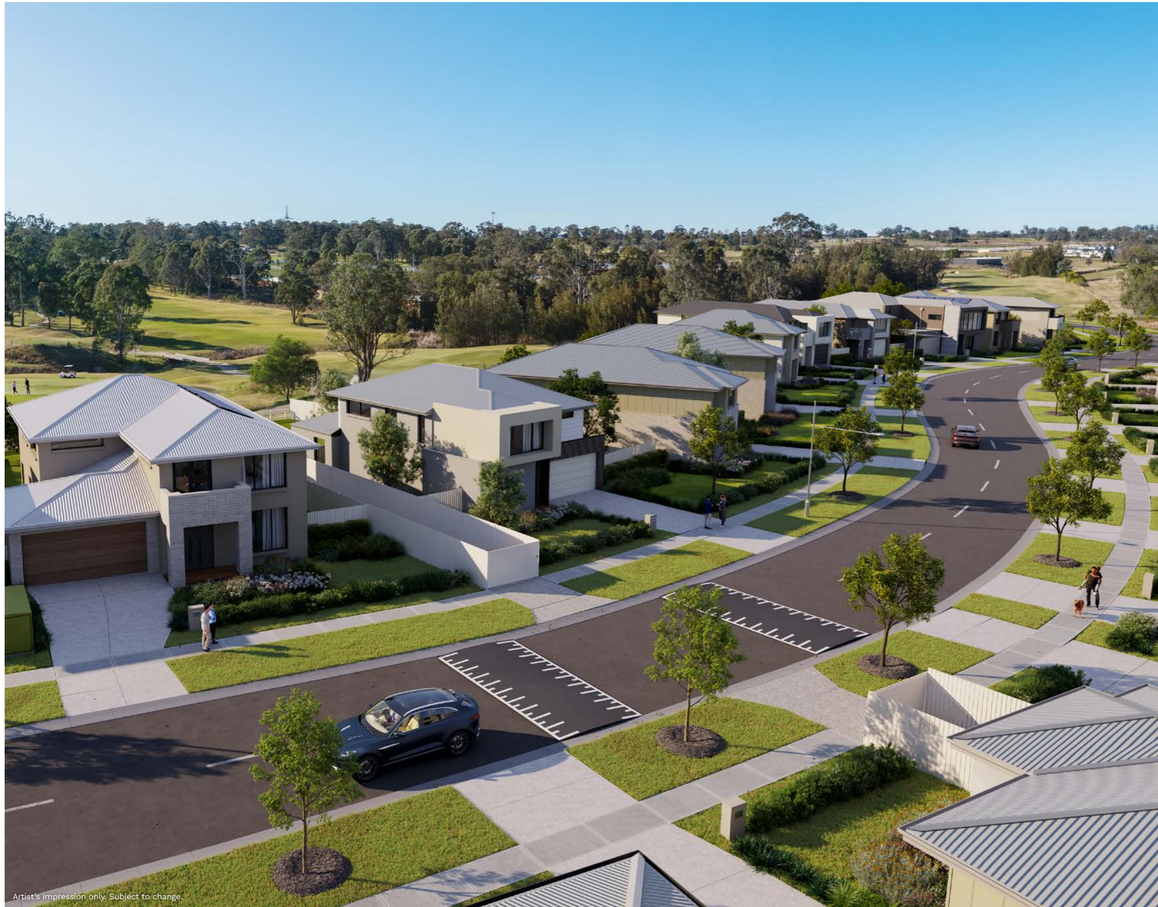
Artist's Impression only. Subject to change.