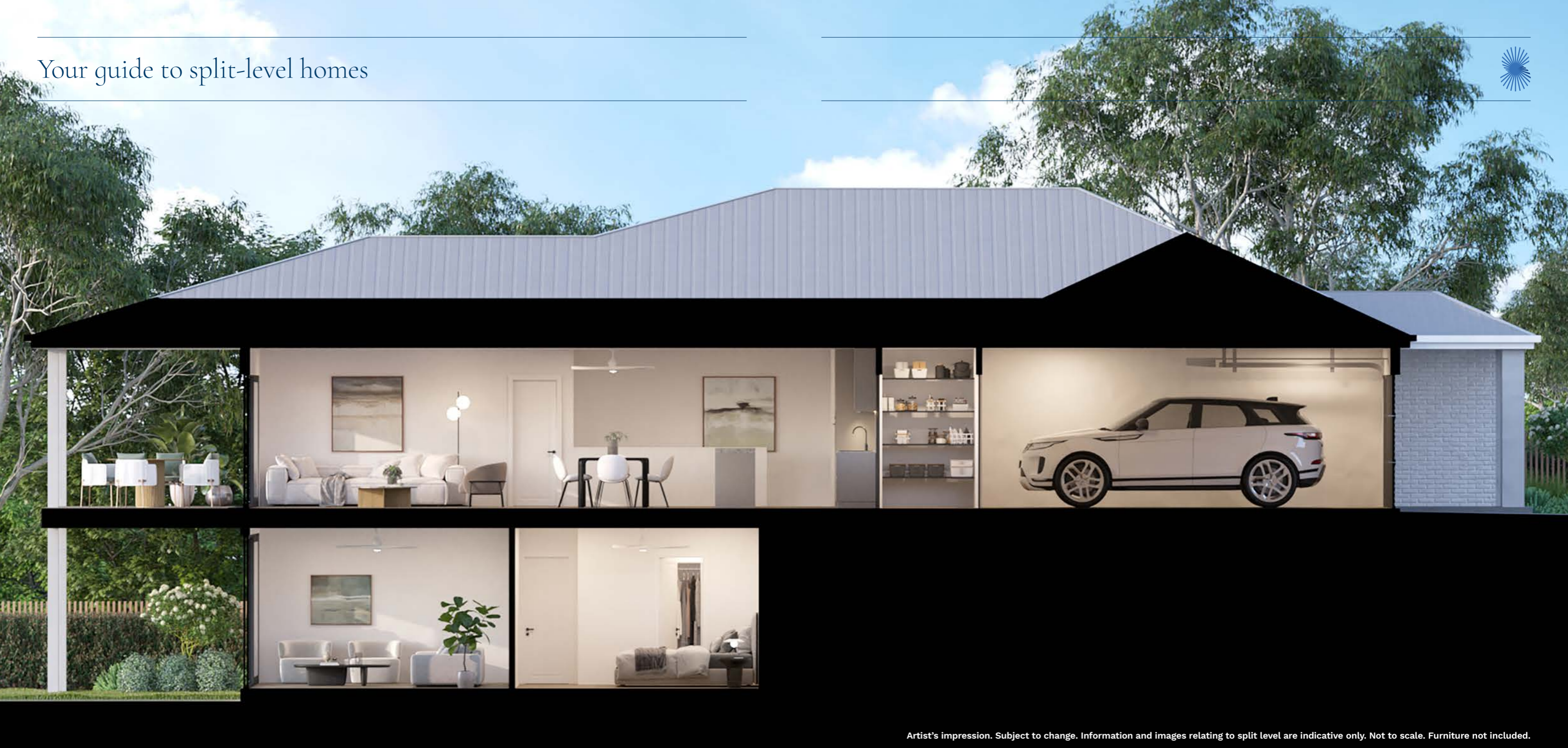
Artist's impression. Subject to change. Information and images relating to split level are indicative only. Not to scale. Furniture not included.