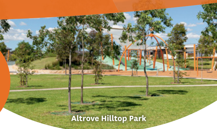
Altrove Hilltop Park

We are excited to present to you our inaugural construction update. We're pleased to say, there's plenty of great news to share with you all.