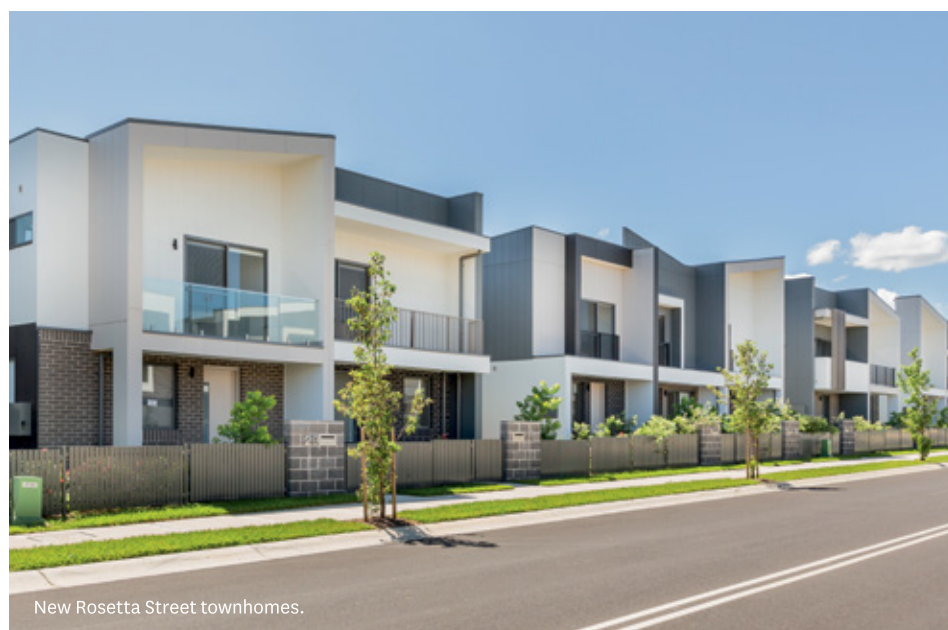
New Rosetta Street townhomes.

We ask for your patience throughout this time, but as always, welcome any feedback and suggestions.