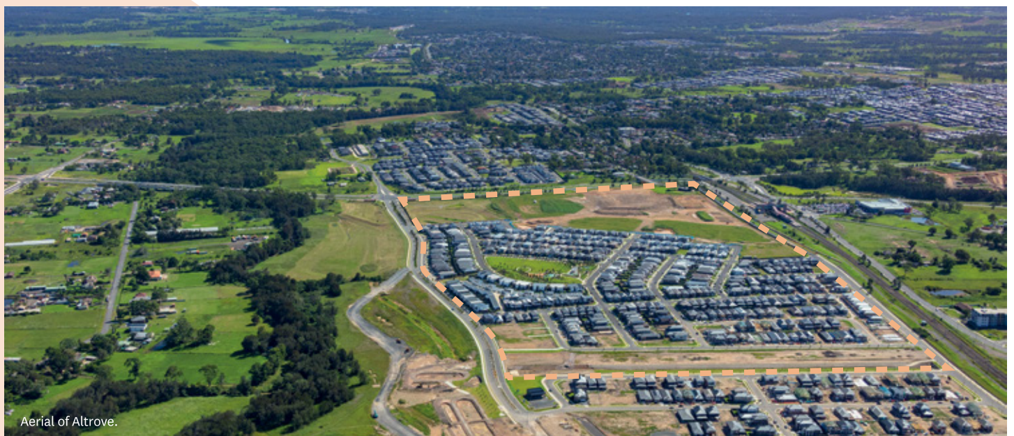
Aerial of Altrove.