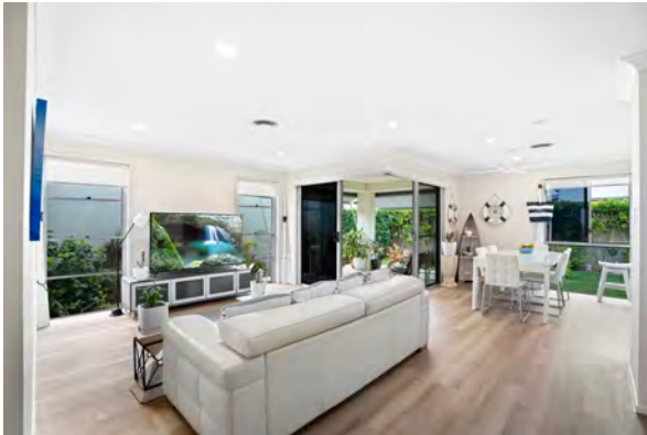
36 / 1 HALCYON WAY HOPE ISLAND