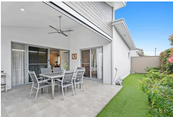
97 / 7 HALCYON DRIVE PIMPAMA