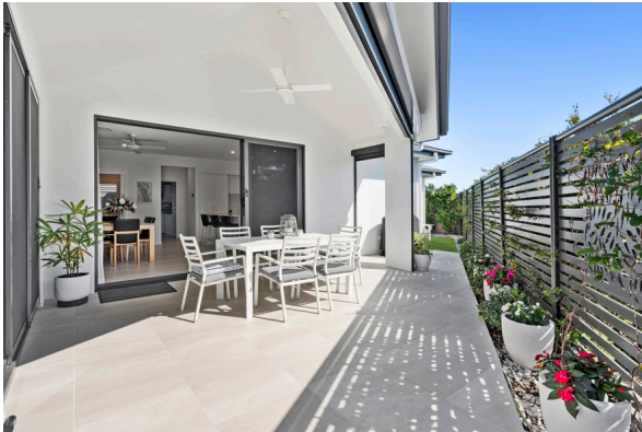
446/7 HALCYON DRIVE PIMPAMA