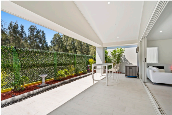
388/7 HALCYON DRIVE PIMPAMA