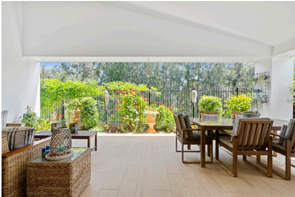
383 / 7 HALCYON DRIVE PIMPAMA