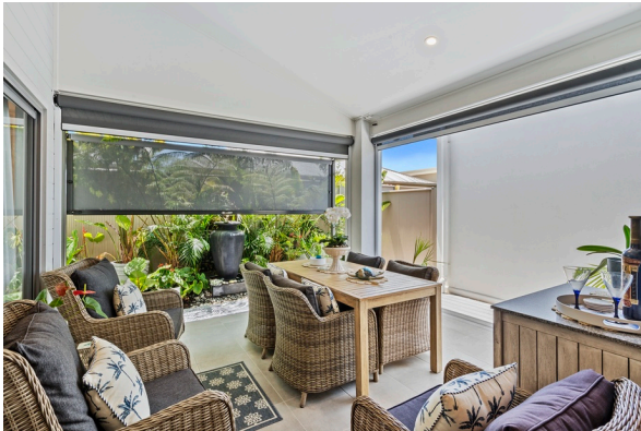
338/7 HALCYON DRIVE PIMPAMA