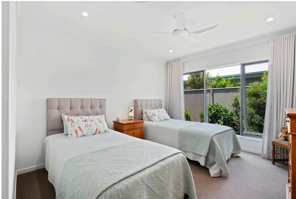
231/7 HALCYON DRIVE PIMPAMA