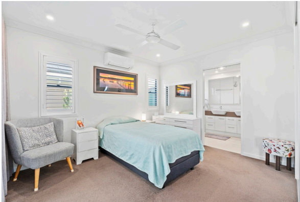
195 / 7 HALCYON DRIVE PIMPAMA