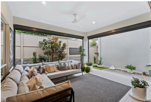
238 / 7 HALCYON DRIVE PIMPAMA